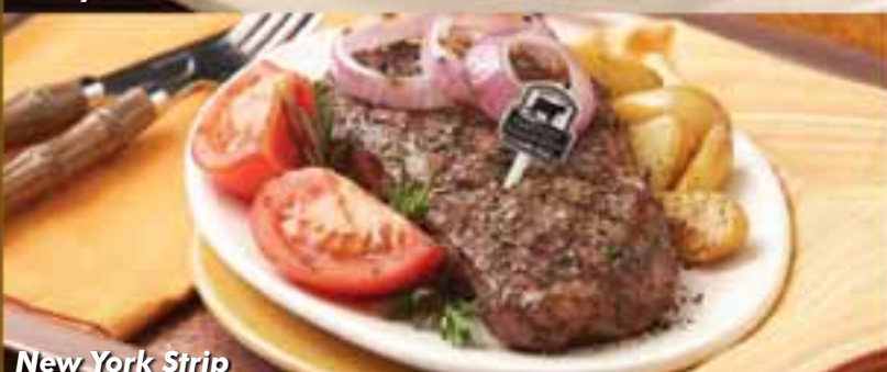
New York Strip